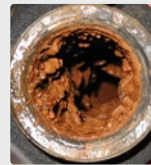
Biofilm in a piping system