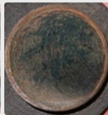
Biofilm in a piping system