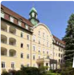
St. Joseph Hospital, Berlin