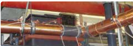
Vulcan S250 installed in the St. Joseph Hospital

" ... a couple of months ago we had the Vulcan S250 installed inside the hospital. We can identify considerable benefits of the unit installed. We can barely see any scale deposits on the shower heads for example any more. This saves manpower and costs of the replacement of sanitary equipment. We can honestly recommend the unit installed by Christiani Wassertechnik GmbH ... "