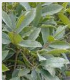
Plants and turf