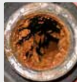
Biofilm in a piping system