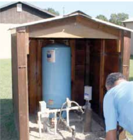
Home well water system