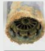
Nozzle of a faucet