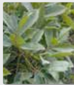
Plants and gardens