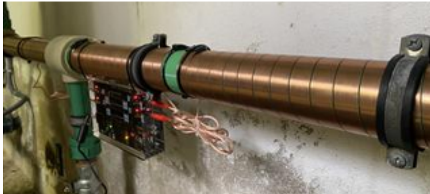
Vulcan S25 at the cold water pipe with Ø 63 mm for 30 apartments