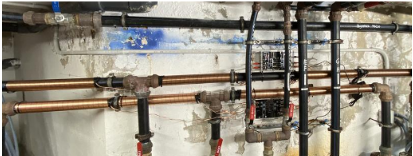
Vulcan S25 2 x at the cold water pipe with Ø 50 mm for 48 apartments