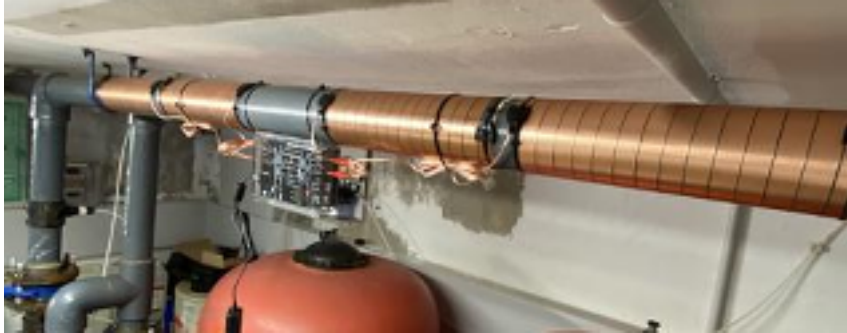
Vulcan S50 in the swimming pool water circuit N°1 with Ø 90 mm